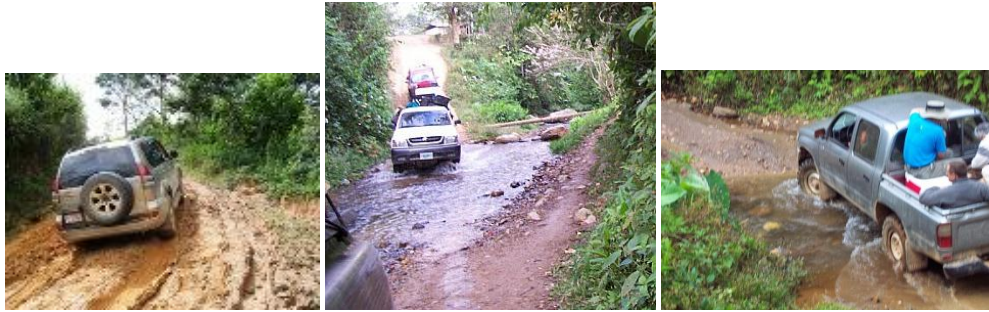
[Honduras Mission Trips Co.]

Only some of the roads in the larger cities of Honduras are paved, others are cobblestone and most are dirt. In the rural areas they are mostly all dirt and due to the average rainfall there are often landslides making the roads impassible or causing vehicles to get stuck due to heavy mud.