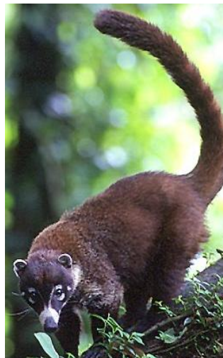
This is a Coatimundi

What kinds of animals do they have in rural Honduras? Just about every kind you can think of actually. For instance one Veterinary Team from Texas has had huge success and since they have been coming around many report that their animal losses are almost nil due to the great care. They tend to over 4600 cattle and various other animals such as; oxen, horses, donkeys, dogs, cats, pigs, goats, sheep, assorted birds, and an occasional coatimundi. What is a coatimundi?